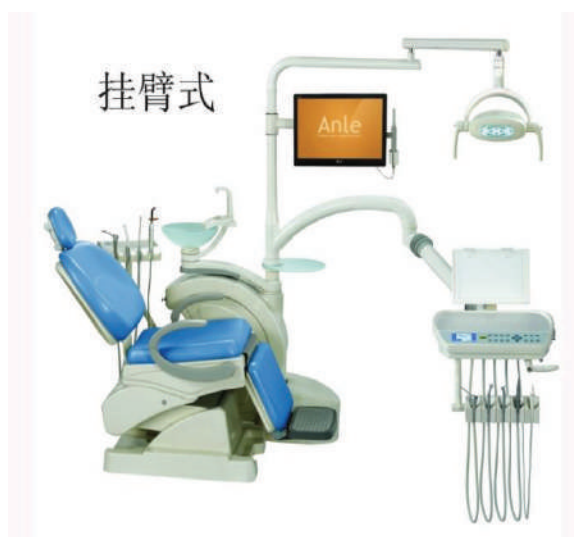
DENTAL CHAIR - SANOR'S