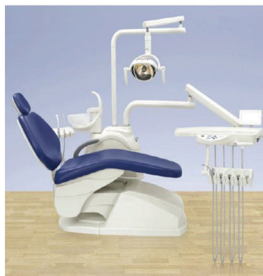
DENTAL CHAIR - AA