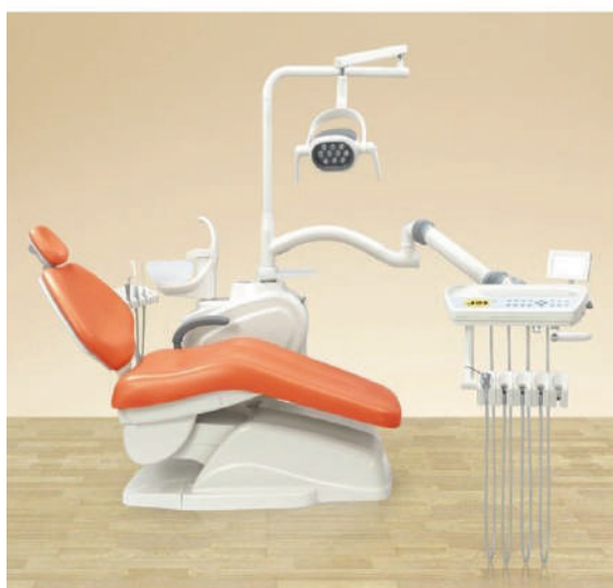
DENTAL CHAIR - HG