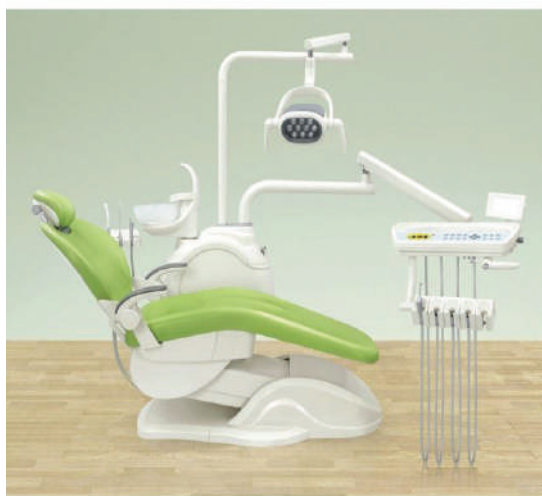
DENTAL CHAIR -SD